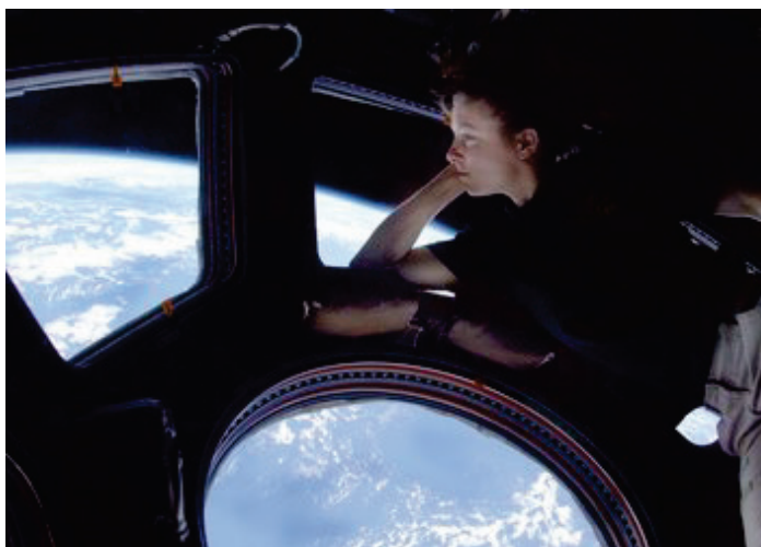
Fellow Astronaut Doug Wheelock took this photo of Tracy as she was reflecting upon her amazing view of Earth from aboard the ISS.